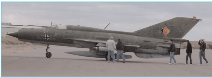
Above: Checking out a MiG-21; below, ASM Field Trippers in the hangar.