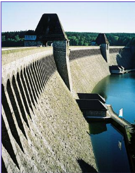
The Möhne Dam (the first dam hit and the most famous of the three targets)

ley, but the Sorpe dam sustained only minor damage.